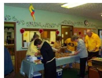
Meyersdale Senior Center Steeler Rally