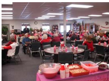
Somerset Senior Center Valentines Party